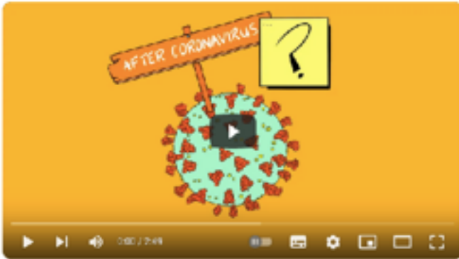
A New Common Sense

As a quick introduction to the social vision, have a look at this very short, 3 minute video, that a group of us made in May 2020 during the first Covid lockdown. Although the specific pandemic issues are no longer relevant, the social analysis is still spot on and the video gives a very concise and powerful introduction to it. See https://earthconnected.net/2020/12/06/a-new-common-sense/ on my website.